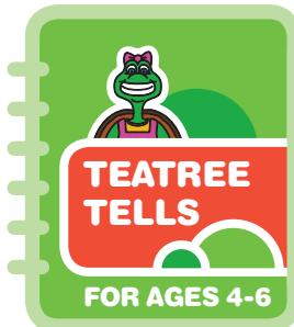
LESSON AND ACTIVITY BOOK

Receive a free puppet! (you must cover the shipping costs)